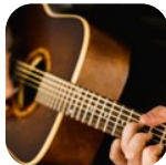
Michigan Musicians Of One Achord